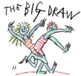
The Campaign for Drawing